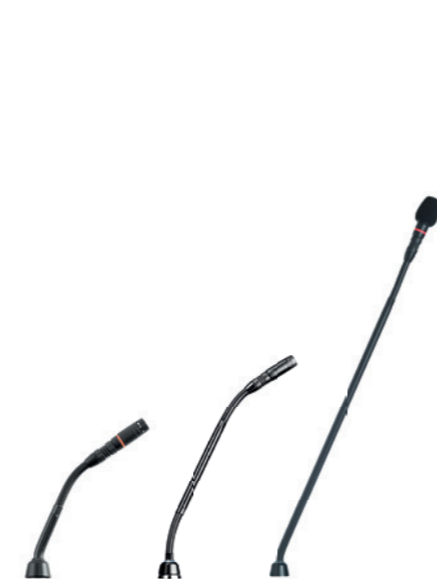
MX405, MX410, MX415 without base