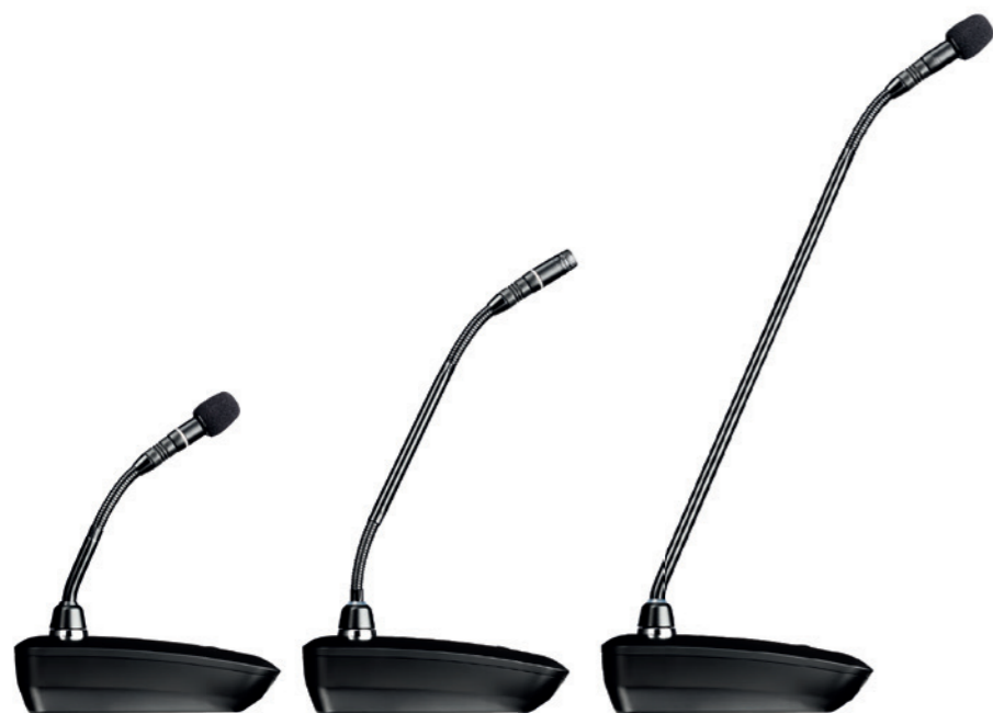
MX405, MX410 and MX415 with ULXD8 Wireless Desktop Base