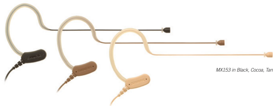
MX153 in Black, Cocoa, Tan