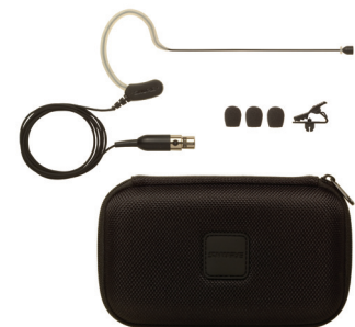
MX153 with Accessories