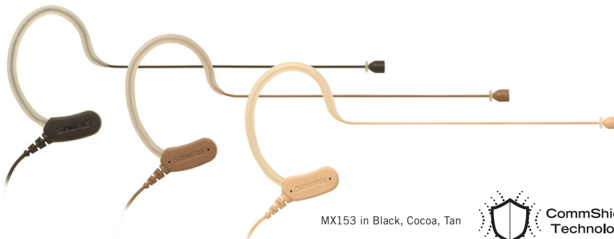
MX153 in Black, Cocoa, Tan