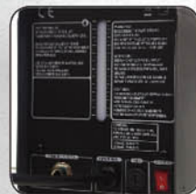
• Rear Panel