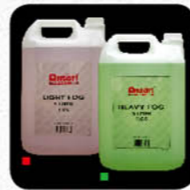
• FLR-5 Light Fog Liquid • FLG-5 Heavy Fog Liquid