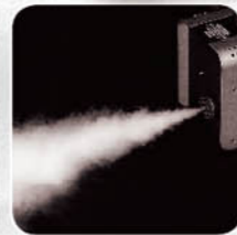
• Z-800II Effect