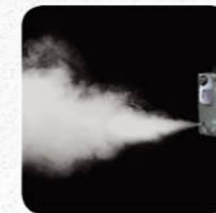
• Z-1020 Effect Horizontal Output