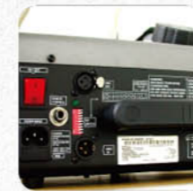
• Control Panel