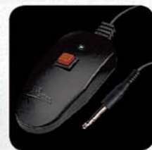
• Z-10 Remote