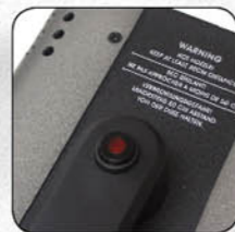
• Manual ON / OFF Button