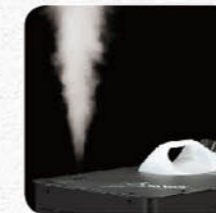
• Z-1020 Effect Vertical Output