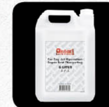
• FLC-5 Water Based Fluid