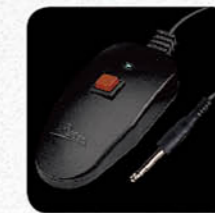
• Z-10 Remote