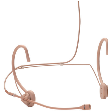
TG H74c tan